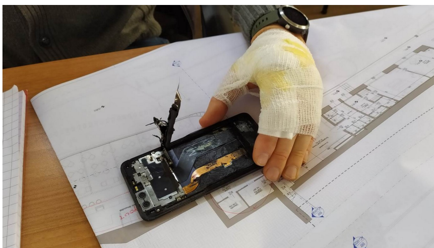
Skin burns after trying to remove from a mobile phone a battery that had started the thermal runaway process