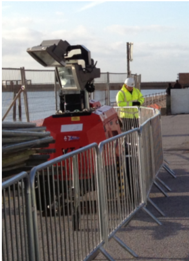
Figure 2: Portable generators should be stood on level ground and clear of combustible materials

6.8 Refuelling should not take place when the generator is operating or still hot from recent use.