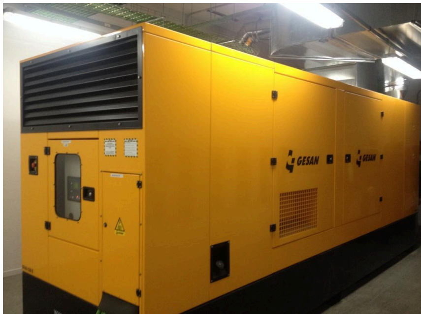
Figure1: Fixed generator installed within a building.

5.6 Where electronic protection takes the form of feedback to limit the current output, the internal transfer switches shall operate so as first to eliminate the least critical portion of the connected electrical load.