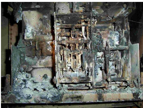
Fig. 3: Power switch of a 1 MW wind turbine – destroyed by fire

Low voltage switchgear was installed within the nacelle of a 1 MW wind turbine. The bolted connection at one of the input contacts of the low-voltage power switch was not sufficiently tightened. The high contact resistance resulted in a significant temperature increase at the junction and in the ignition of adjacent combustible material in the switchgear cabinet. The fuses situated in front did not respond until the thermal damage by the fire was very severe. Control, inverter and switchgear cabinets that were arranged next to each other suffered a total loss. The interior of the nacelle was full of soot. Despite the enormous heat in the area of the seat of fire, the fire was unable to spread across the metal nacelle casing. The damage to property amounted to EUR 500,000.