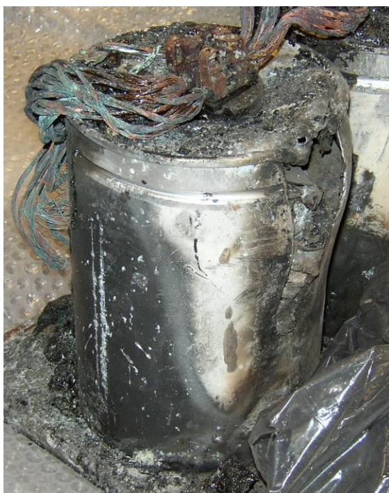
Fig. 4: Burst pressure vessel of a line filter capacitor

Several areas of damage were caused by parallel resonant circuits existing of capacitors (reactive power compensation or line filters) and inductances (generator, turbine transformer, energy supply companies, power chokes, etc.) which had not been taken into account when designing the turbine. The resonant circuits were activated by harmonics. Resonance phenomena generated high currents which damaged capacitors. Breakdowns in the dielectric of the already damaged capacitors – usually caused by overvoltage events – resulted in an increase of power loss and in some cases in the bursting of the capacitor containers. The resulting fires caused total loss to the reactive power compensation or to the inverter. Protective circuits through discharge resistors and choking were not available in these cases.