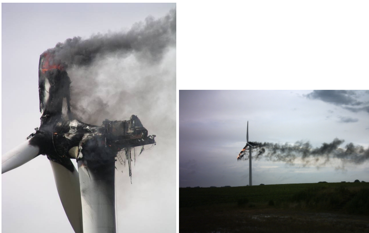
Fig. 1a+b: Fire after lightning struck a 2 MW wind turbine in 2004

The burning blade stopped at an upright position and burned off completely little by little. Burning parts of the blades that fell down caused a secondary fire in the nacelle.