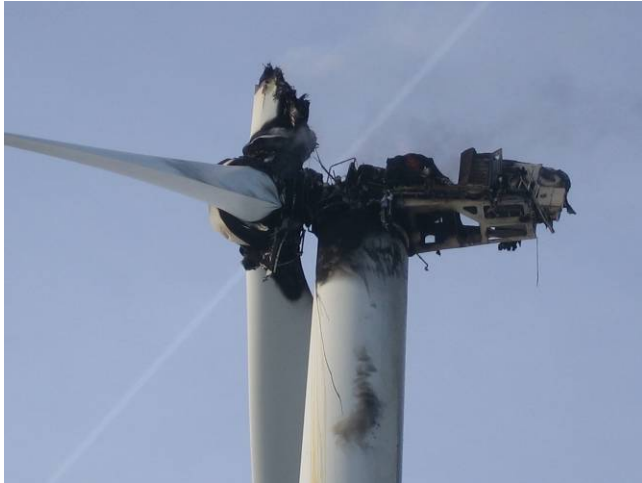
Fig. 2: Burnt down nacelle of a 1.5 MW wind turbine