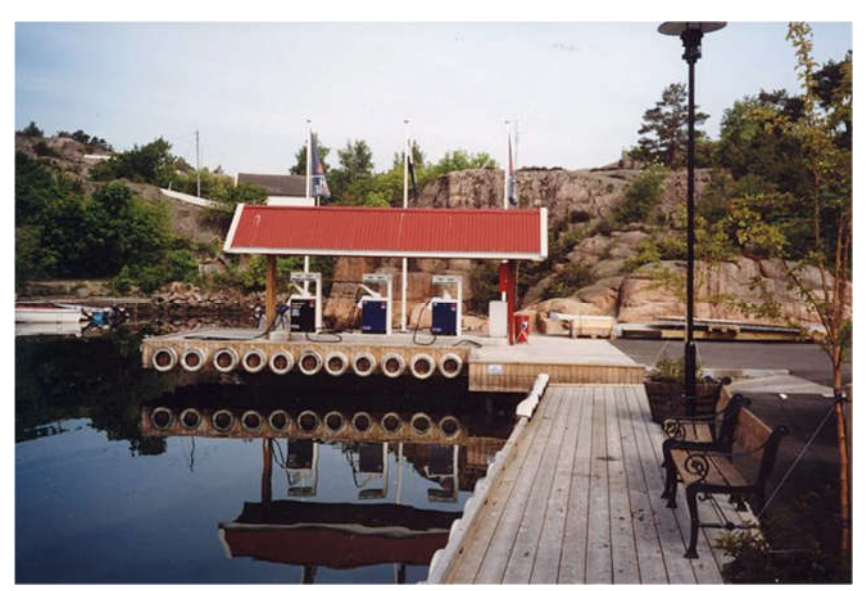
Fuel station for boats in Lyngør Norway

Boats should be moored in a way so that it quickly can be moved in an emergency. Other boats should wait for a free space before entering the fuel station.