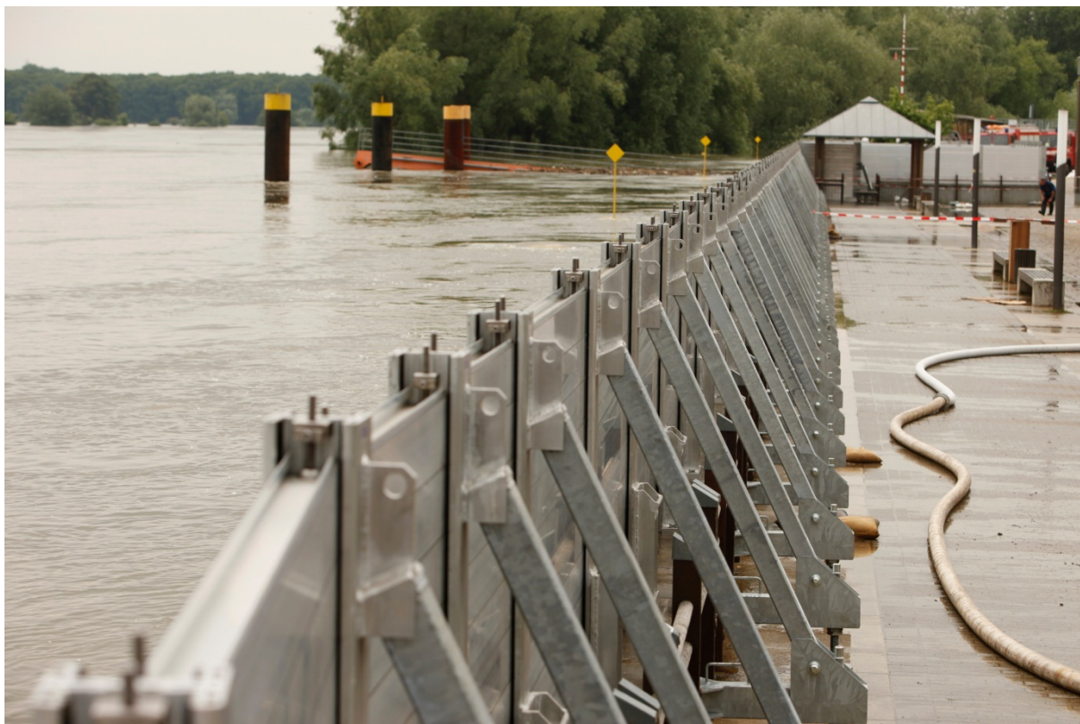
Figure 5 Example of use of a demountable flood protection wall

The responsibility of local and technical protection measures are generally controlled by the public administration, such as local municipalities